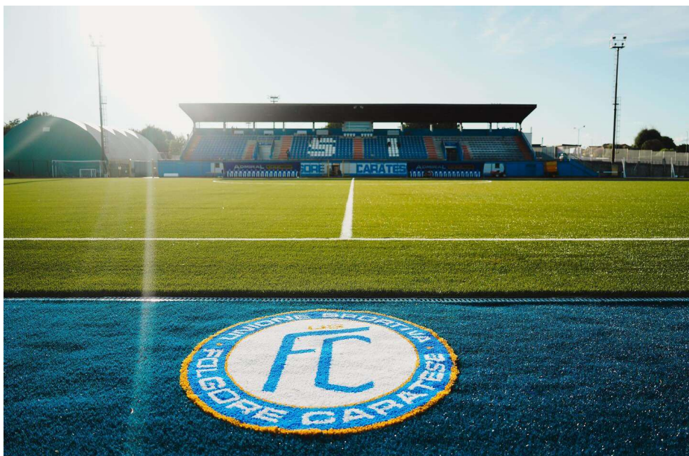
Latest-generation synthetic football pitch. 1.450 seats