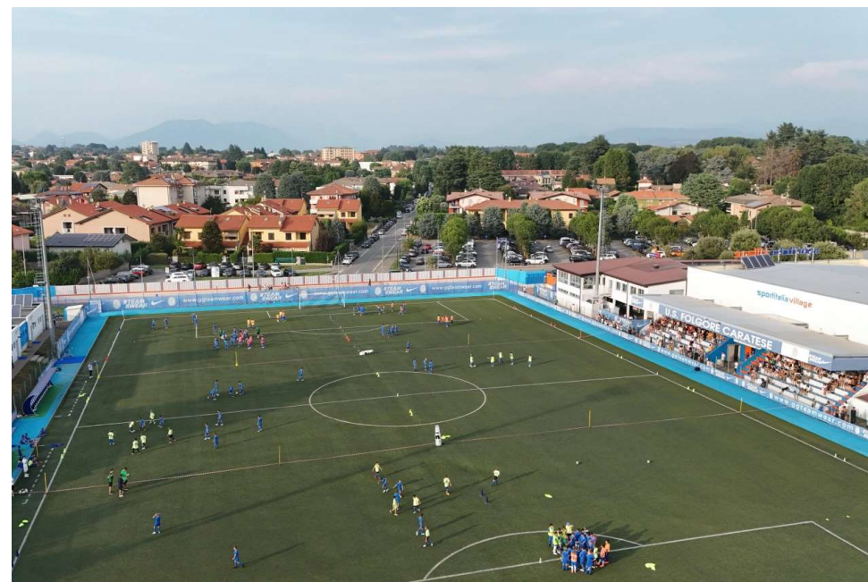
Synthetic football pitch. 300 seats